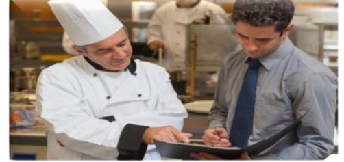
Hotel & Restaurant