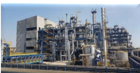
Petrochemical & Fertilizer