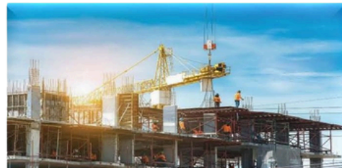
Construction & Infra