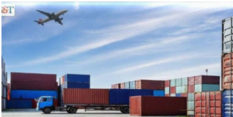
Transport & Logistic