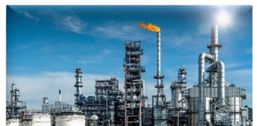
Oil & Gas Refinery